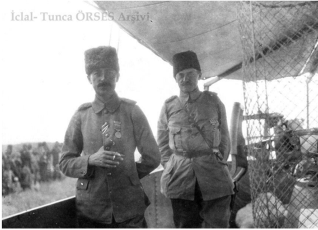
Figure 2. The Victory of the Ottoman Soldiers.