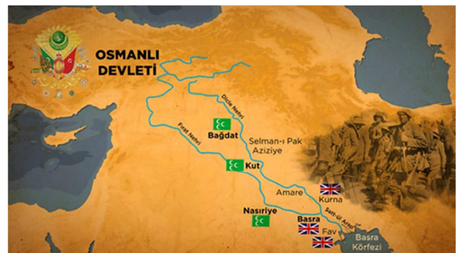
Figure 1. The Place of Kut.

British Army and over 100 years have passed since the victory of Kut'ül-Amare, thousands of soldiers, five of whom were generals. This victory which took place that is now far away from where Turkey is now, could only affect the course of the Great War [4] for a short time. The wrong decisions of the big headquarters in Istanbul and Berlin 10 months later the British Army's progress could not be stopped did not prevent major collapse.