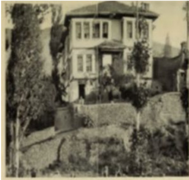
Figure 6. Yozgat City houses for the British Prisoners.

British prisoners were held in Armenian vacated houses