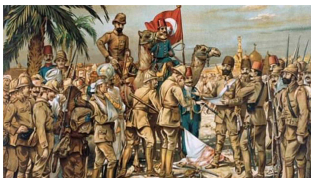
Figure 5. The second Victory after Çanakkale.

"Lions! Honor and glory to the Ottomans, the black square of the British land in the sunny skies of our martyrs' souls fly with joy while laughing, I congratulate your sentence by kissing all of your pure foreheads. My army has killed 350 officers and 10,000 soldiers in the face of both Kut and the armies who came to rescue Kut. But today, in Kut, 13 generals, 481 officers and 13,300 soldiers take over. The British forces, who came to the rescue of this army, returned 30,000 casualties. Looking at these two differences, there is a big enough difference to astonish the world. History will be inconvenient in finding words to write this event. Here is the first victory of Ottoman persistence broke the British stubborn in Çanakkale, the second victory here."