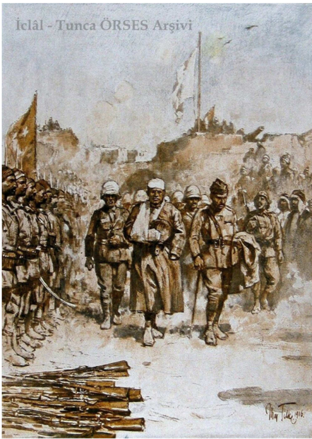
Figure 3. The Great War Kut 'ül-Amare.